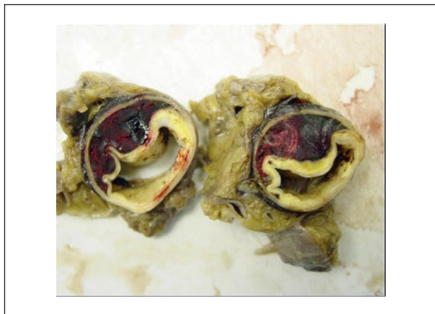
Figure 3. Thickened dissection flap with false lumen thrombosis in a patient with a chronic type B dissection.

risk of SINE. Therefore, it is suggested to avoid significant oversizing when planning TEVAR for chronic TBAD. 1,7-9